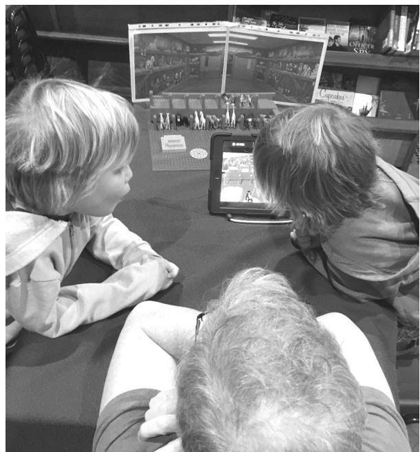
ABOVE: The Lego Choir in session. Weekly children's activities combining Lego, music and stories from the Bible have begun at St Paul's - see report inside.