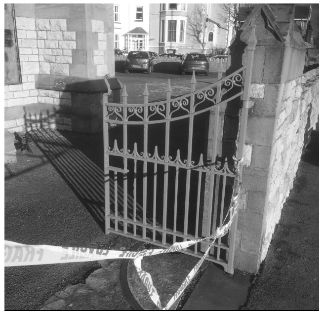
ABOVE: "Fling wide the gates!" The main entrance to St Paul's is looking somewhat smarter for a coat of paint, seen here at the undercoat stage.

There will be a Lent Quiet Day for the Mission Area on Tuesday 4 th April at the Cathedral. The day will begin at 10.30 am and finish at 3 pm. Lunch will be provided. At the time of writing we are not certain of the cost, but it will be around £10, to cover cost of lunch and teas/coffees as well as a donation to the Cathedral. Sign up forms will be available in all churches, so please fill one in and return to The Parish Office, Beach Road East, Penrhyn Bay. LL30 3NT by 27 th March. Details of the programme will also be available in our churches.